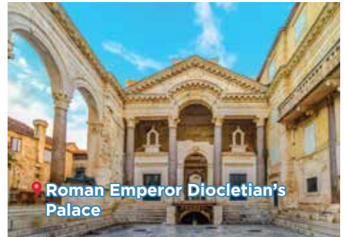
Roman Emperor Diocletian's Palace