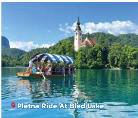
Pletna Ride At Bled Lake