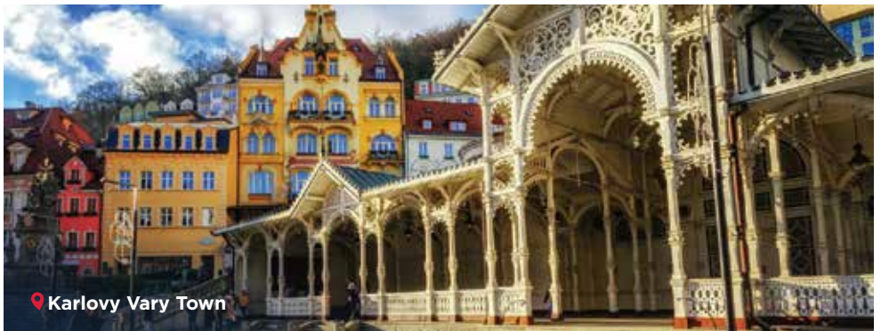
Karlovy Vary Town