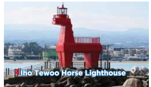
Iho Tewoo Horse Lighthouse