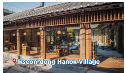
Ikseon-dong Hanok Village