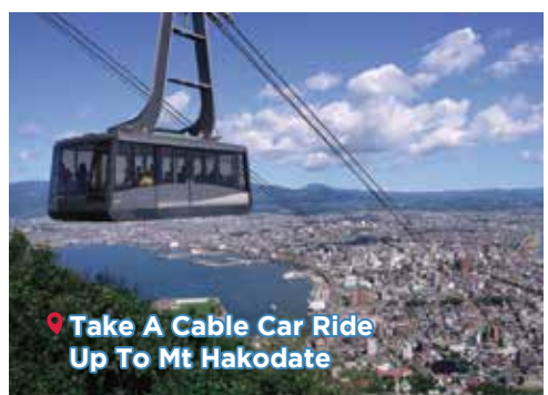
Take A Cable Car Ride Up To Mt Hakodate