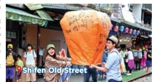
Shifen Old Street