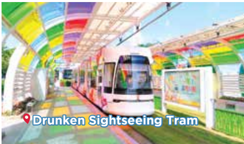
📍 Drunken Sightseeing Tram