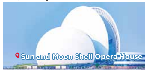
📍 Sun and Moon Shell Opera House