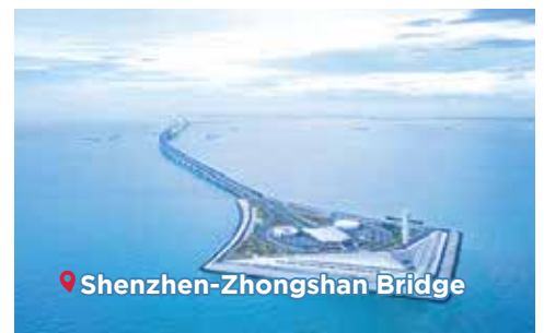
📍 Shenzhen-Zhongshan Bridge