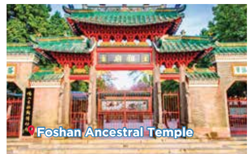
📍 Foshan Ancestral Temple