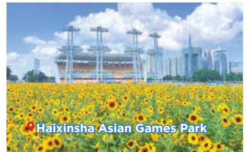
📍 Haixinsha Asian Games Park