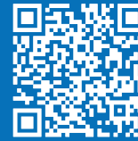
NZTD Website Application NZTD 申请网站