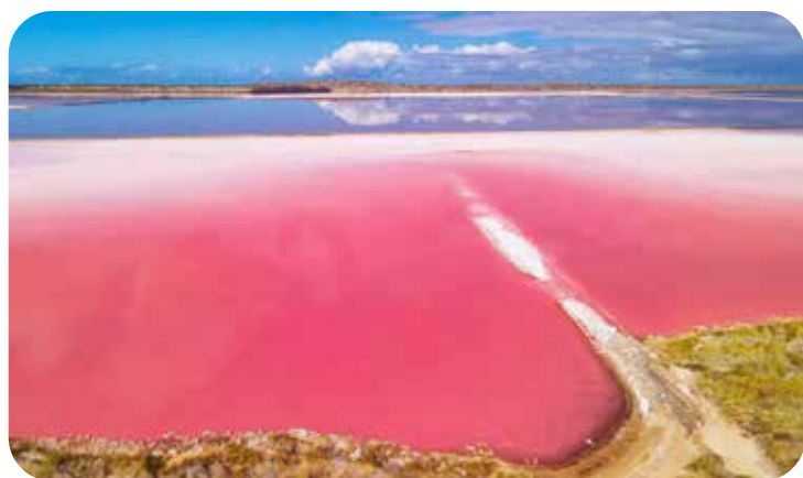
PERTH+PINK LAKE 珀斯+粉红湖