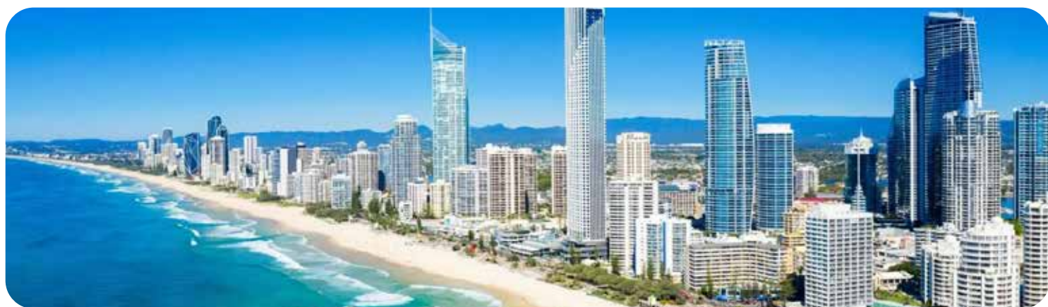
BRISBANE+GOLD COAST 布里斯本+黄金海岸