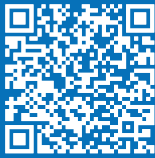
NZTD (Apple Store) NZTD (苹果商店)